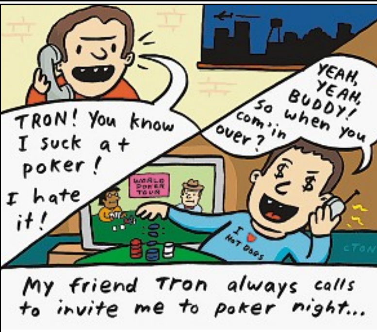
BY: CLAYTON HANMER. READ THE LIFE OF CTON AT dose.ca/cton